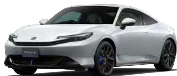
Winter Frost Pearl (NH-937PX)