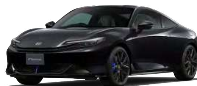
Crystal Black Pearl (NH-731PX)