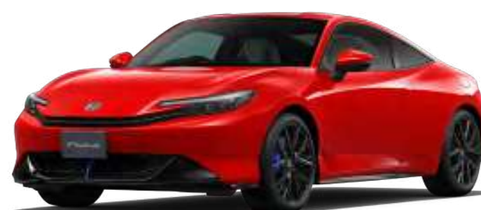
Rallye Red (R-513X)